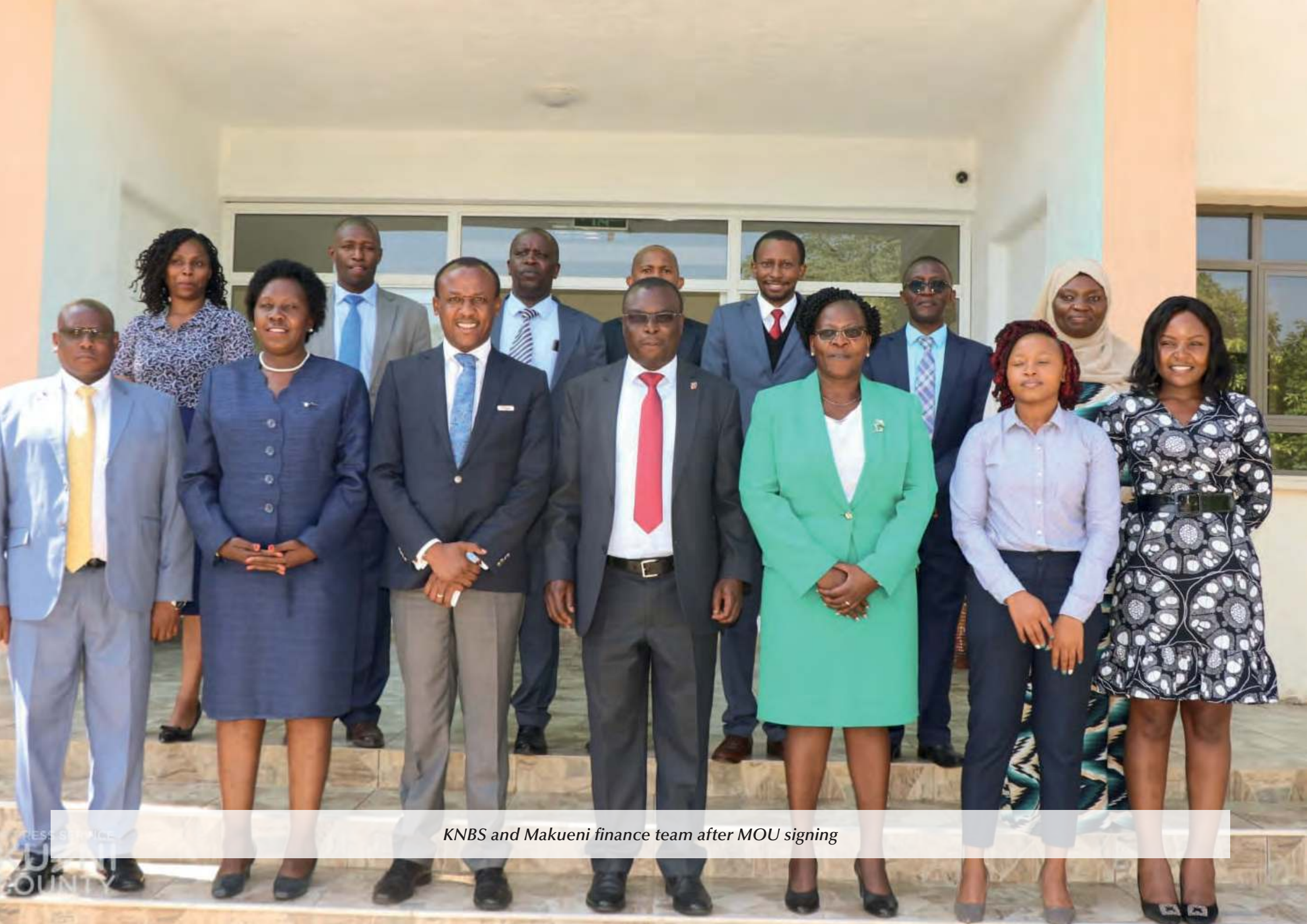
KNBS and Makueni finance team after MOU signing