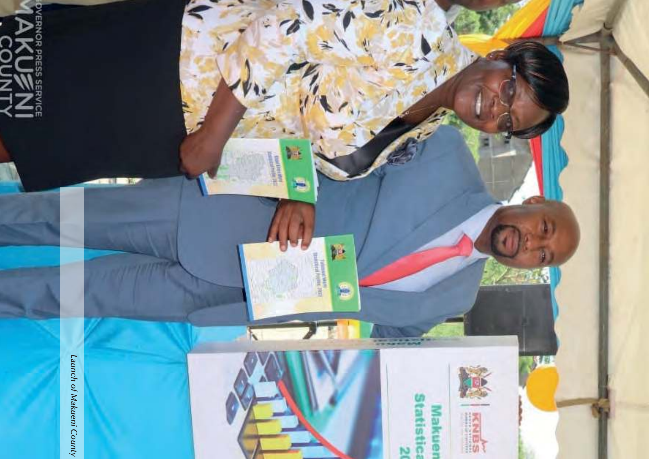
Launch of Makueni County