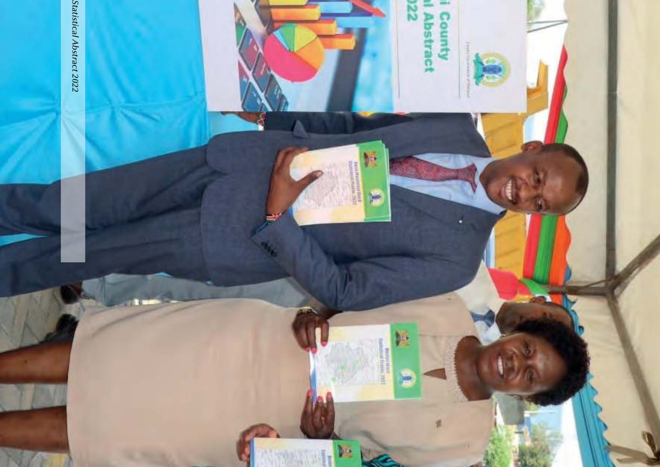
Statistical Abstract 2022