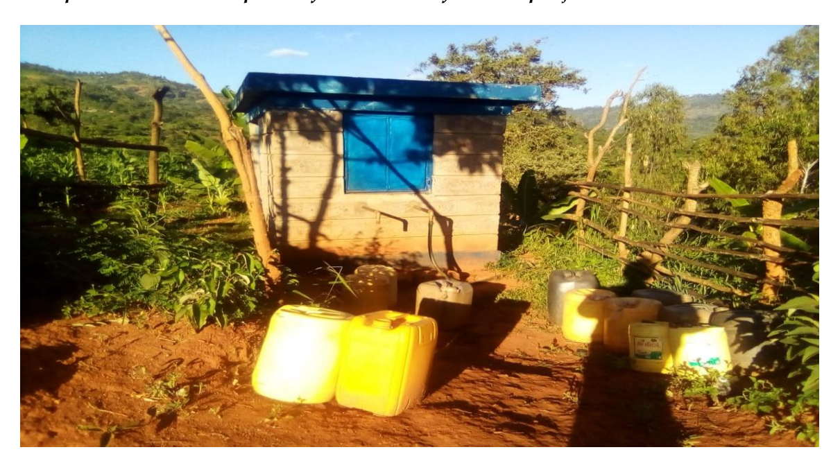
Communal water point