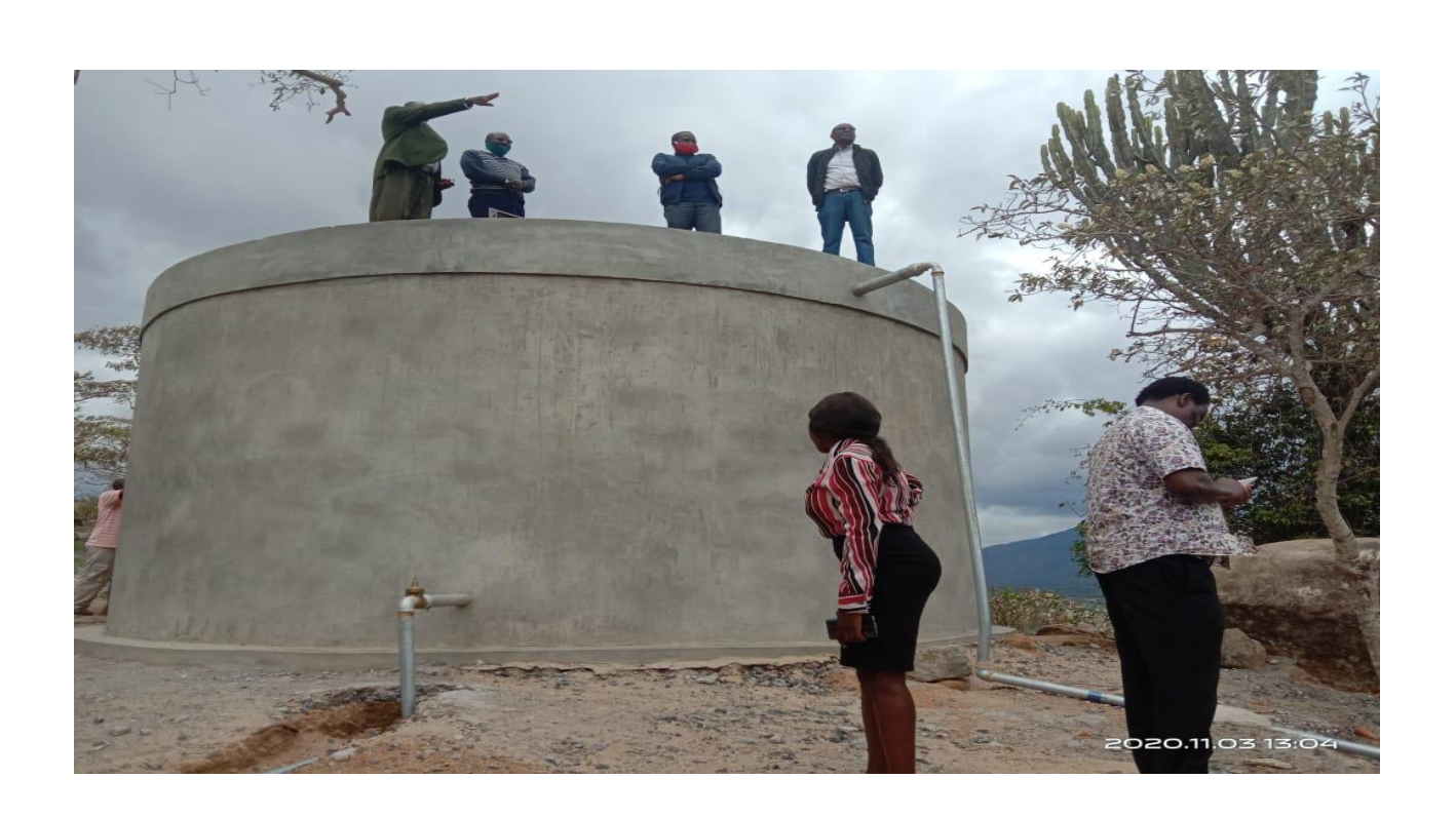
Masonry storage tank