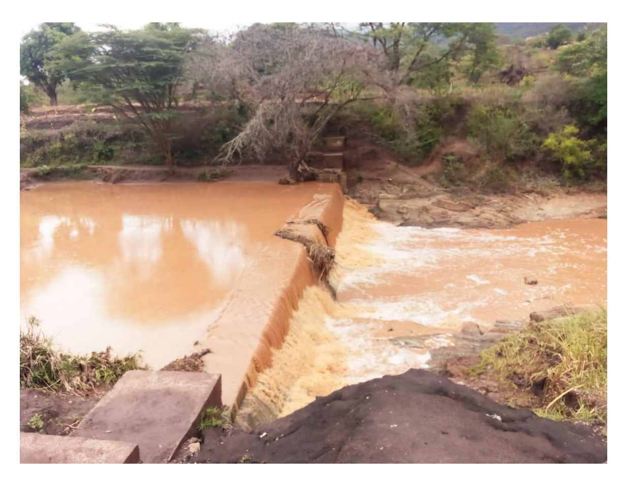
Figure 2: Status of the Kwa Kisela sand dam