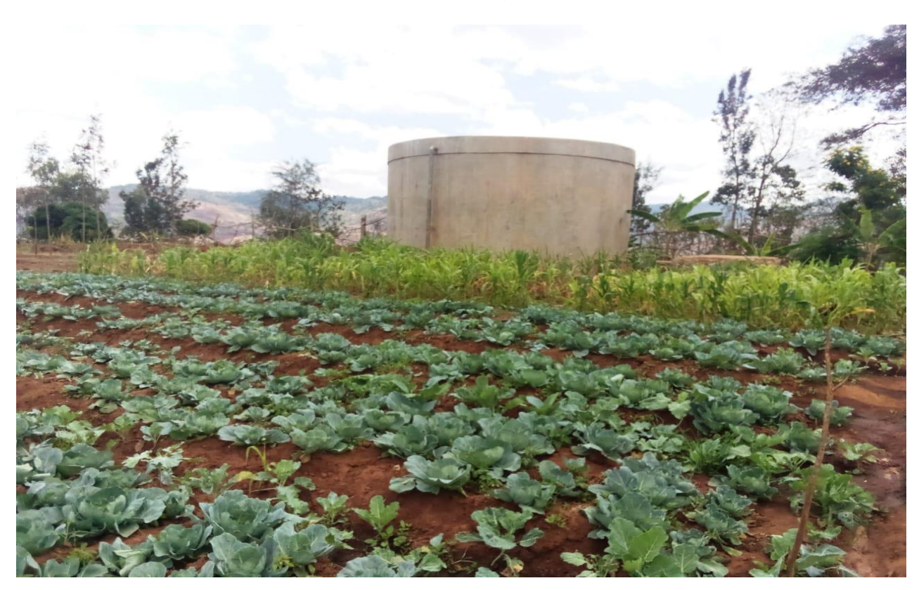
Figure 1: Kwa Kisela 100 m³ masonry storage tank at Kiniu