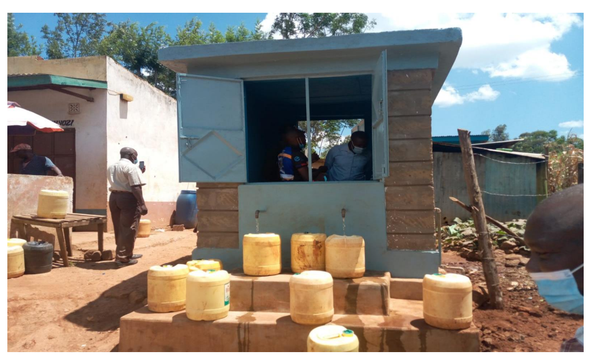
Figure 3: One of Kwa Kisela Sand Dam Water Project's Water Kiosk