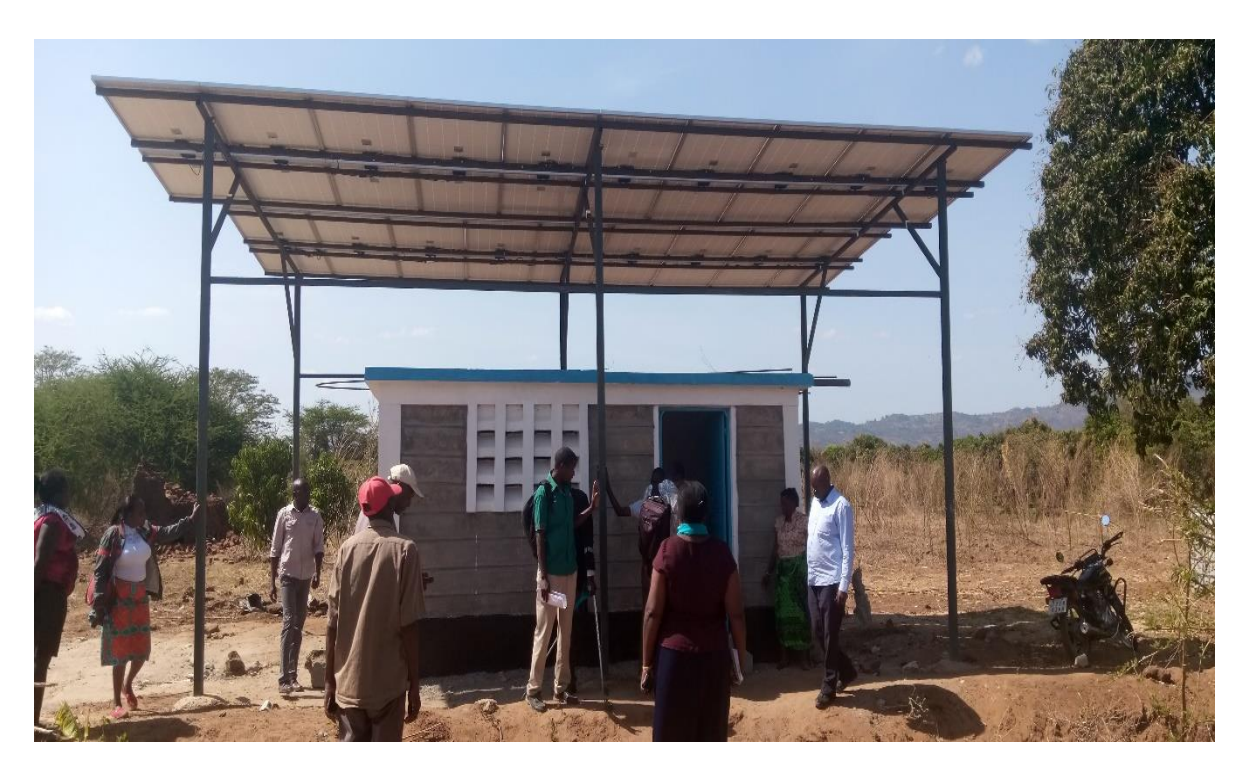
Project solar system and power house complete