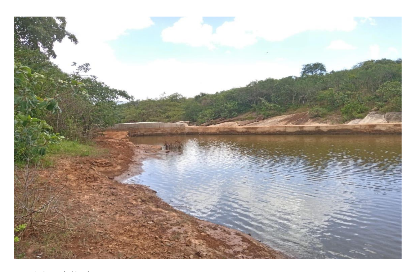
Sand dam full of water