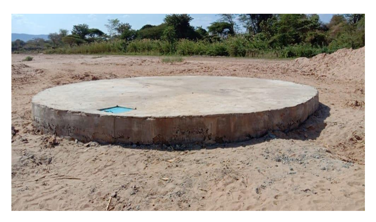
Project intake sump tank at the river