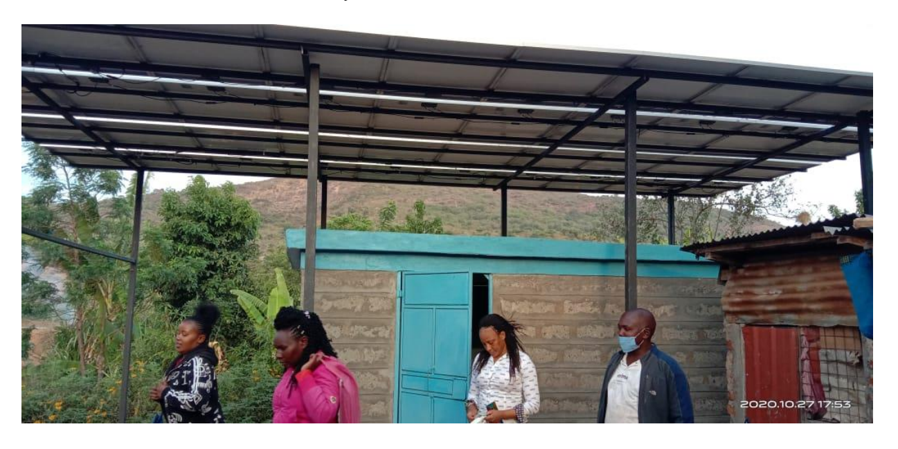
Power house and Solar panels.