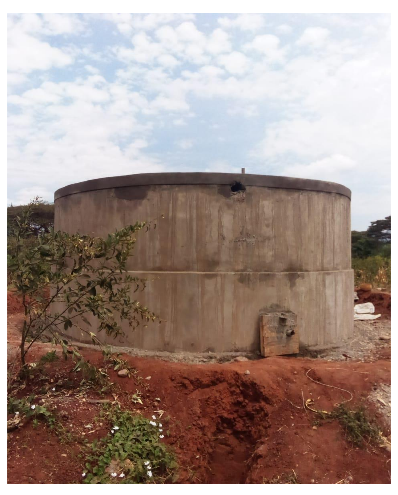
Masonry tank during construction