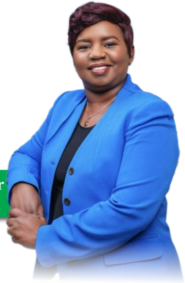
H.E Deputy Governor Lucy Mulili