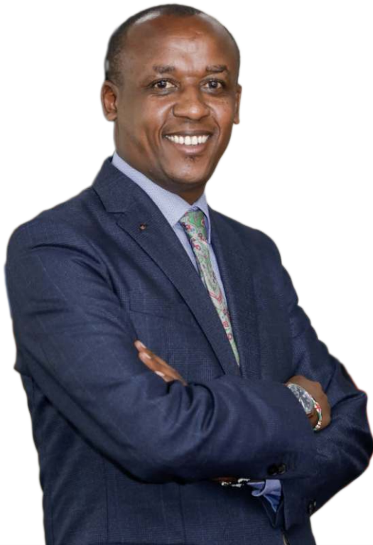
H.E Governor Mutula Kilonzo Jr