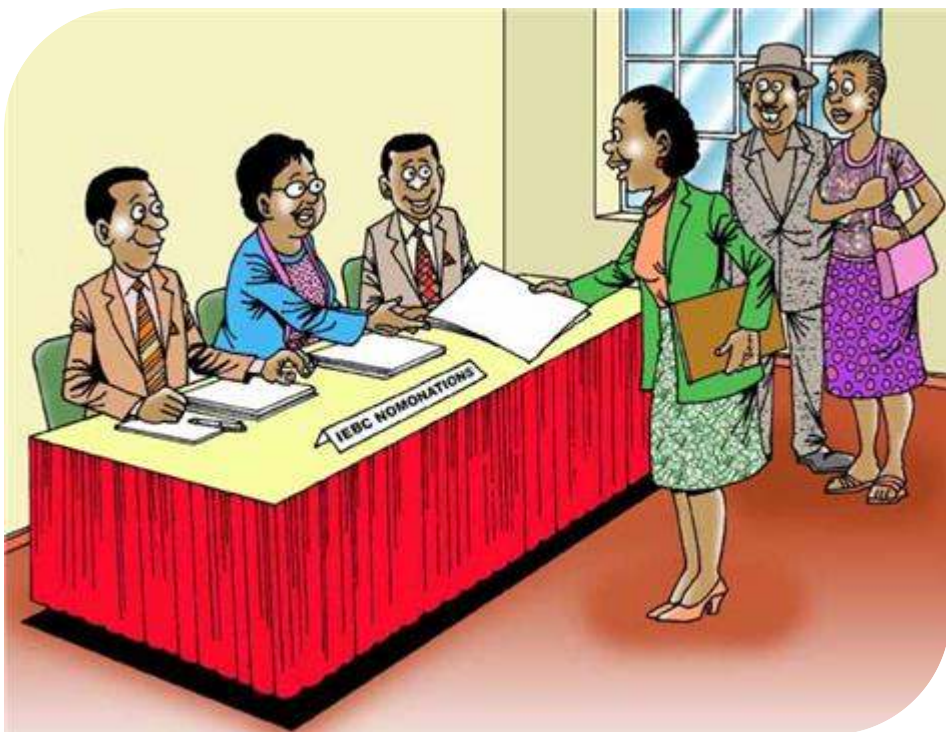
Figure 5 : Officers verifying nomination requirements

There are different requirements for one to qualify to be elected in any of the six elective positions.