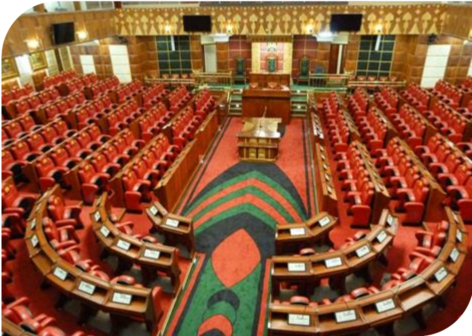
The National Assembly