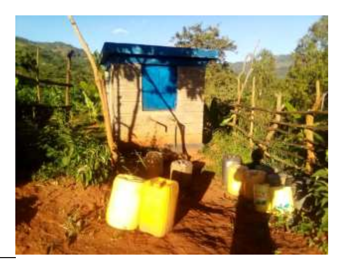
Communal water point