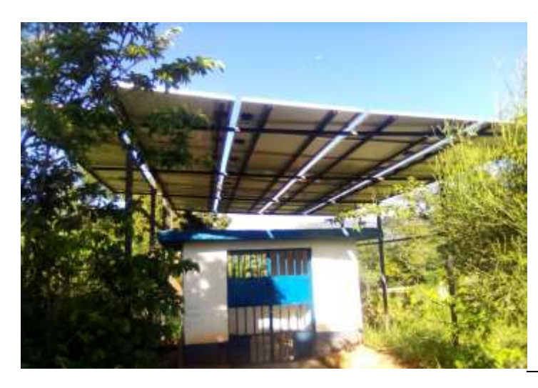
Pump house and solar panels for Isuuni drift water project